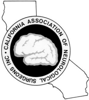
EXHIBIT OPPORTUNITY CANS