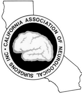
EXHIBIT OPPORTUNITY CANS